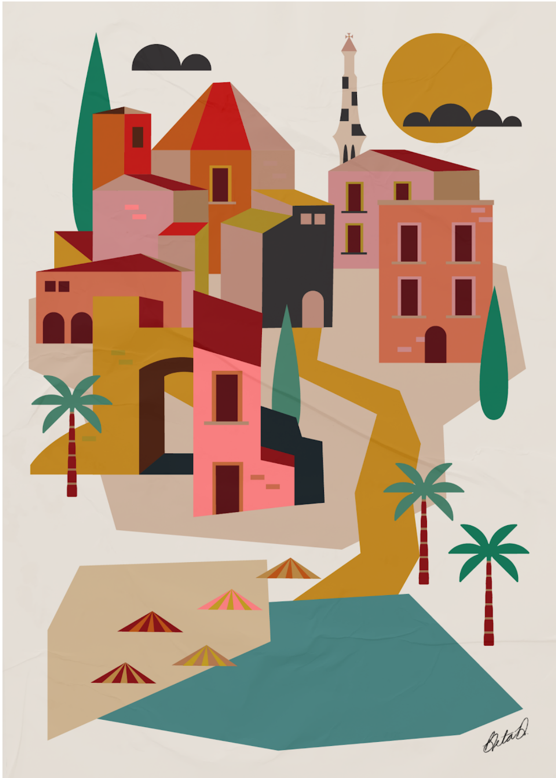
Art by Beta DeFlorian, SDC 2015 Spain Picasso y Flamenco